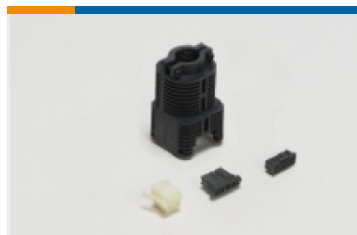
Rectangular Connector Housings(1)