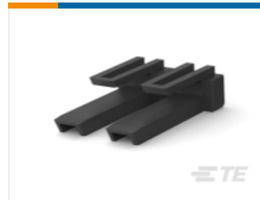
TE Part # 1744544-2 EP II TPA 02P, BLACK