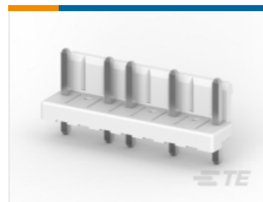
TE Part # 1-2316952-8 3.96 EP HDR ASSY 8P, NO PIN 2,5,7