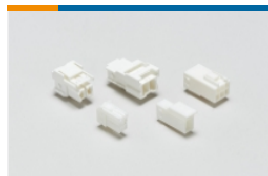
Rectangular Power Connectors(64)