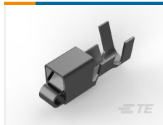
TE Part # 1123721-2 ECONOMY POWER CONN REC CONT