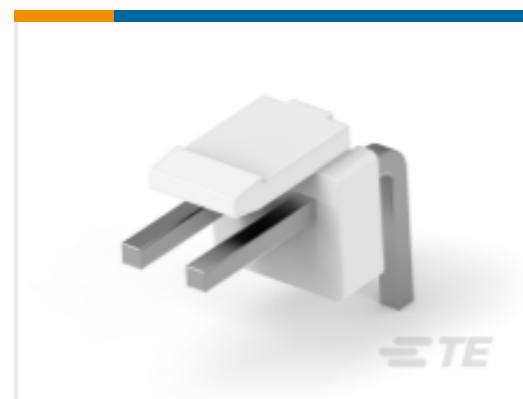
TE Part # 1744428-2 3.96 EP HDR ASSY 2P R/A, GW