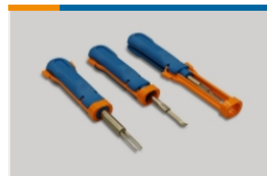
Insertion & Extraction Tools(1)