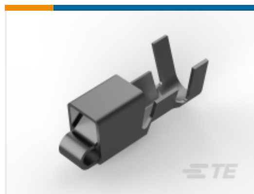
TE Part # 1123721-1 EP CONN. REC CONTACT