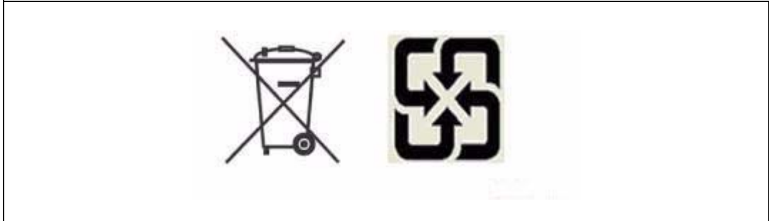
Figure 13. Recycling symbols

This product contains a non-rechargeable lithium (lithium carbon monofluoride chemistry) button cell battery fully encapsulated in the final product.